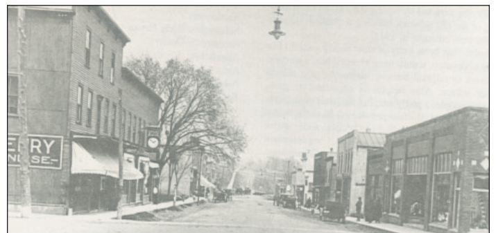
West Division Street 1987

4. #2 East Division was built in 1888 and was the Wright County Farmers Cooperative Store from 1908 through 1921, and then was the Leader Grocery for over 25 years. It then has held a series of department stores (Edelman, Boyd, and finally Johnsons) and then it became an antique store until recently expertly remodeled and preserved by Nelson Builders, #11 East Division , now the home of Country Lane Clothing and Wreath of Franklin, is a part of Division that has long been the site of