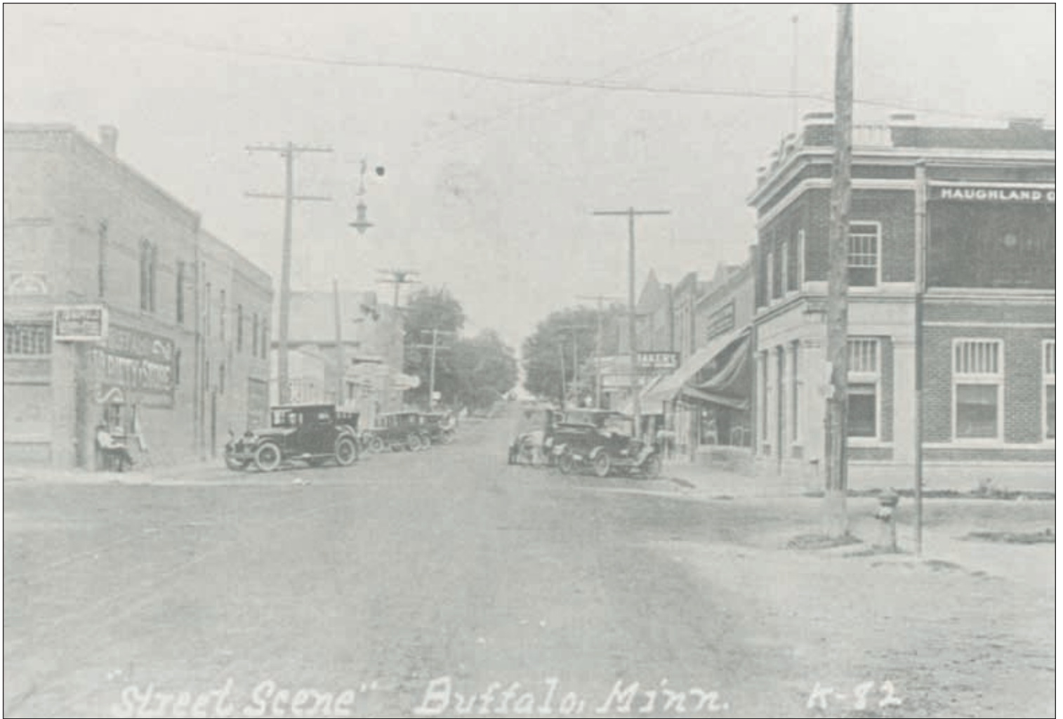
Buffalo Drive 1942