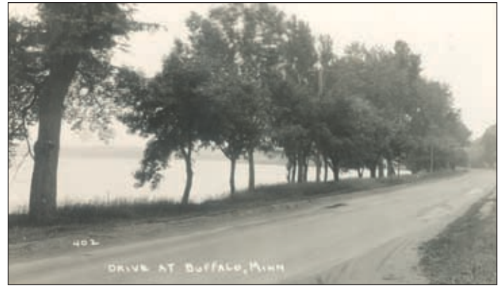
Buffalo Drive Lake