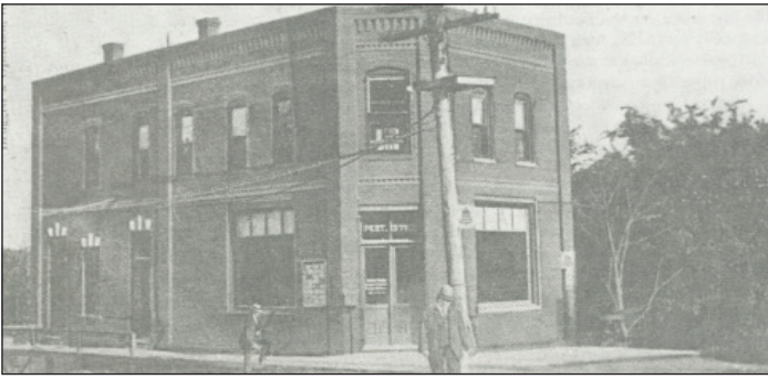
Post Office, 1902 - 1928