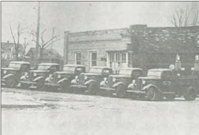
A long time Chevrolet salesroom, the building now housing Jones Cable 1934

7. The drug store at #25 East Division was built in 1975, replacing a number of earlier smaller businesses including the Buffalo hardware and the Christian Meyer building. The National Bank of Buffalo was built in 1917 at #2 1st Ave NE and was at this site until 1961. The building then became a part of the Burkland Retail Complex. Touted as a 'modern' department store, the Burkland Store was built in 1910 at #10 1st Ave NE. It was very large and had men's, women's and children's clothing and also had a grocery department. Growing over the years, it came to incorporate its surrounding buildings. Wayne's Hardware took over the building from 1984-1991. The various buildings in the complex have since housed a variety of businesses.