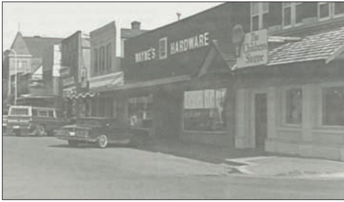
1st Avenue NE, looking north 1987

The Cota Garage (#111 Division) was built in 1920 as an auto repair shop and Hudson Auto sales dealership. It was remodeled and became Esau's Supermarket in 1953. It now has returned to its roots and is an automobile parts store.