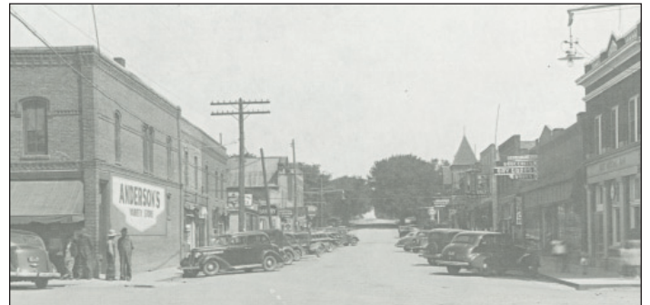
1st Ave NE 1940