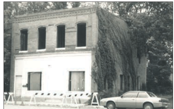
Old Buffalo Journal Press Building 1989

The earliest business district was on the hill to the south of Willow Creek. When the Court House was moved to its current location in 1878, the business district shifted to that area also. After a succession of disastrous fires destroyed those wooden structures, the more substantial brick structures mentioned in this tour were built in this 3rd business area. As seen in this tour, the downtown has had several periods of redevelopment, and now again faces a time of potential change and redevelopment.