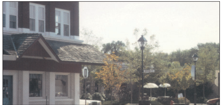
Division Street 1992

6. From this busy corner you can see several stages of Buffalo business development. At #1 1st Ave So you now find Edward Jones Investment co. On that corner was the Standard gas Station from 1930 – 1985. Across the street at #2 1st Ave so was a Skelly Gas Station from 1923 – 1970s. The building had been rebuilt in 1951 and now houses a delicatessen/restaurant. The buildings to the east and to the south of that building were all built in the 1950s in another era of redevelopment, replacing earlier blacksmith shops, lumberyard areas, etc. #12 1st Ave So was Holmquist’s first efforts as a “Supermarket” being earlier in a smaller store on 1st Ave NE. This building was built in 1950