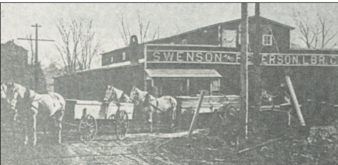
Swenson & Peterson Lumber Company 19xx