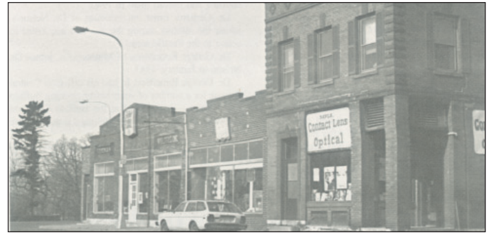
West Division Street 1987

3. #1 West Division was built in 1899 as a saloon by the