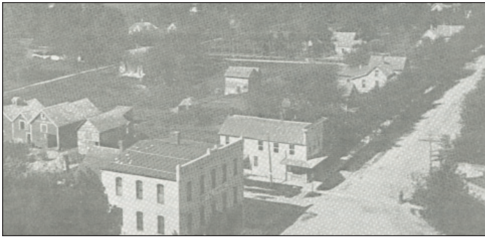
View from Court House tower, looking up Court House Ave., Buffalo hotel in foreground early 1900s.