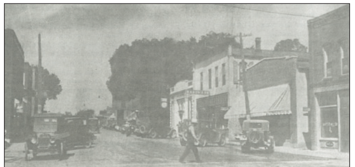
Division Street 1927

and later was a Ben Franklin (1963-1971) and Wagner/Snyder Drug Store (1971-1990s) and now an Ace Hardware Store. #14 1st Ave So was built in 1951 as a bakery, with Hallmark taking over the store in 1975. Many will remember the Bridgeman’s Restaurant and later My Gal Sal’s Restaurant being at #110 Division. At #114 Division Truax Radio & TV was built in 1951. It later became Buffalo Appliance and then Doc’s Appliance.