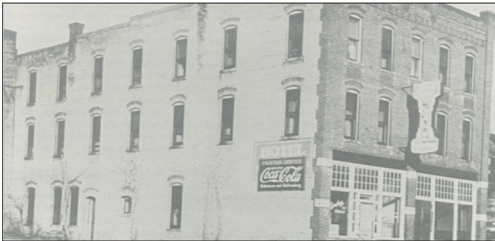
Huber Hotel 1920 - 1945